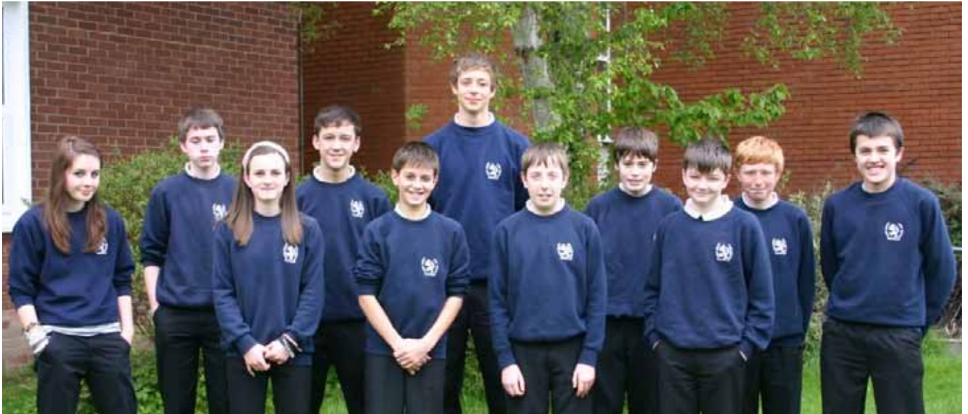
Ysgol Penglais Brass Ensemble who will compete at the National Urdd Eisteddfod.